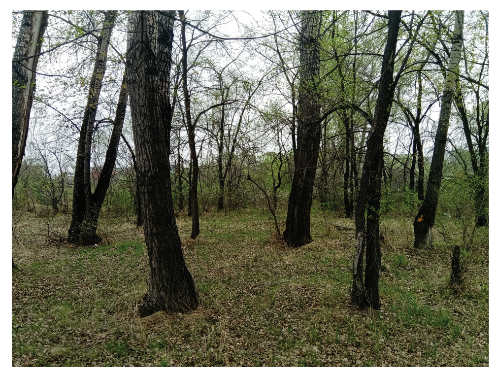
Figure 1. Collecting site of the variegated mud-loving beetles in the Abakan River valley (Abakan city, 53°42'49.5"N, 91°30'19.6"E).