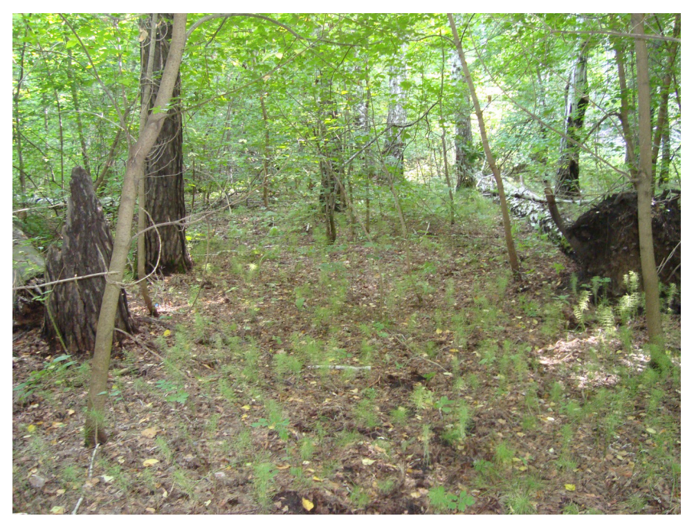
Figure 2. Monodominant community with A. negundo in Barnaul ribbon forest.