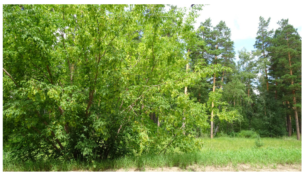
Figure 3. Kasmalin pine forest ( A. negundo more than 25 years old).