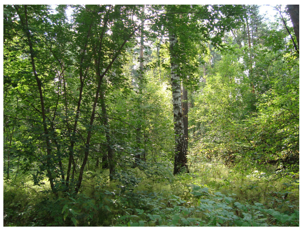
Figure 4. Kulunda pine forest belt.