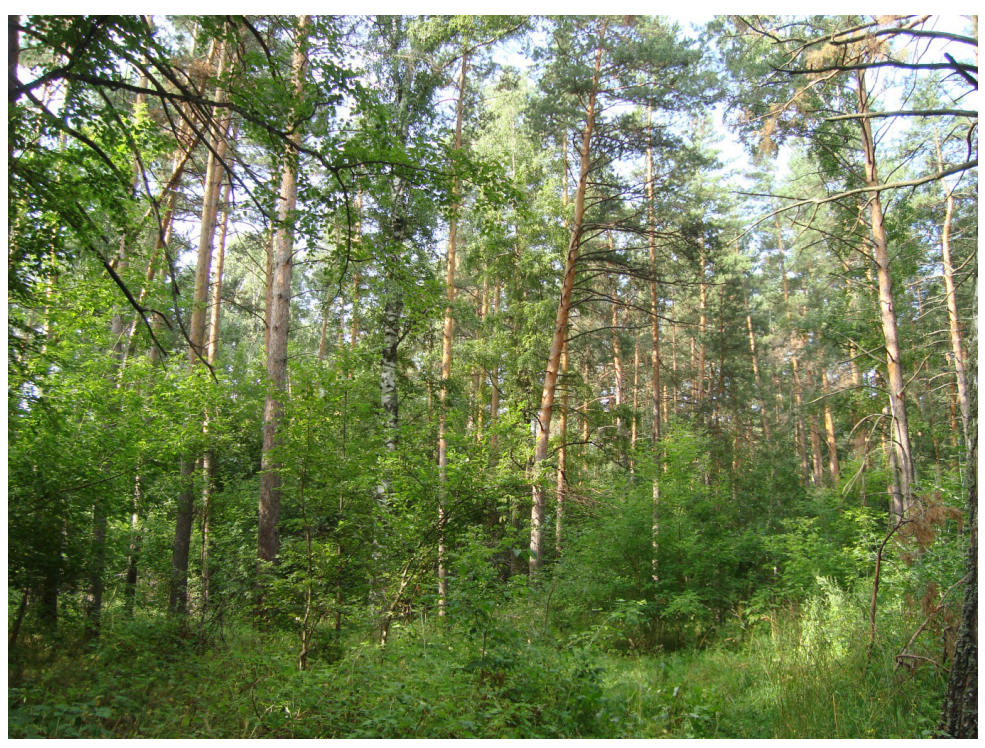
Figure 5. Aleusian pine forest with the participation of A. negundo in the shrub layer.