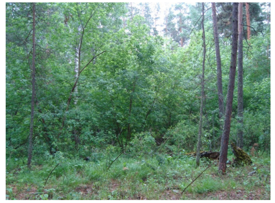
Figure 5. Salix cinerea-Pinus sylvestris community.

Acer negundo exhibits different participation indices in the described forest communities depending on phytocenotic and local environmental conditions. In the Cleistogenes squarrosae–Pinus sylvestris and Potentilla argentea–Pinus sylvestris communities , Acer negundo is occasionally represented in the tree layer. Its cover is no more than 3%, the maximum height is 10 m, it is no more than 20 years old, and the average diameter of the trunks is no more than 6 cm. The representation of the maple in the shrub layer reaches up to 4 m high and 5% of the cover. Seedlings are not observed. Shallow depressions are the most favorable type of microrelief for their growth and development in these communities. In open spaces in good illumination conditions, the maple is represented by a multistemmed life form (usually 2-3-trunked).