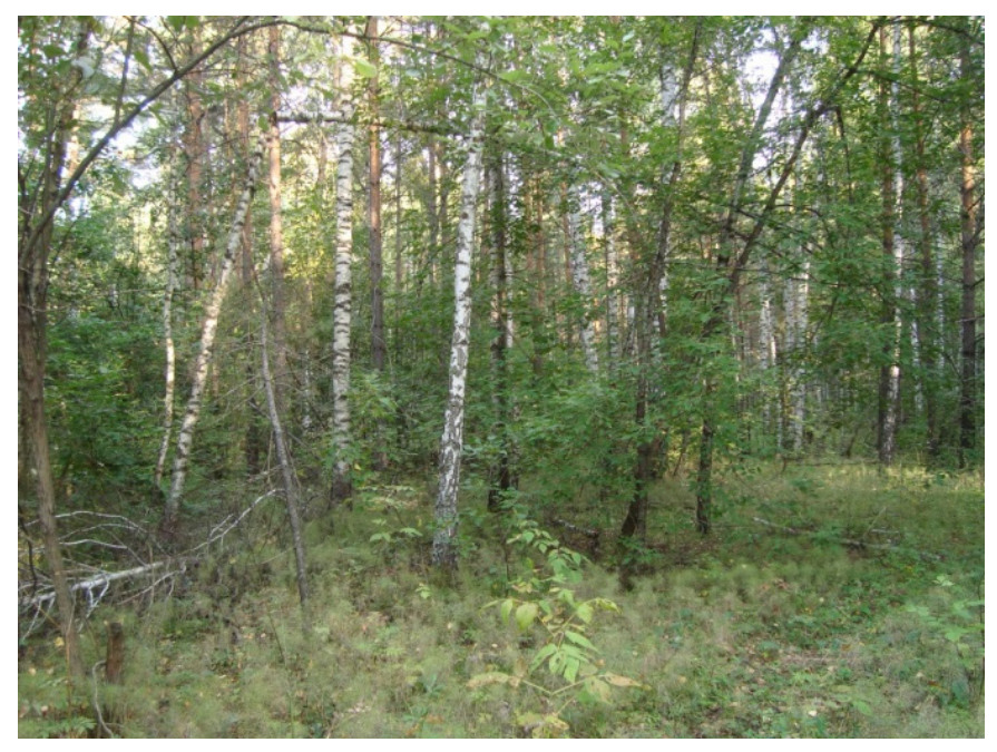
Figure 2. Equiseto hiemalis-Pinetum sylvestris caraganietosum arborescentis association. Ermakov, Makunina et Maltseva ex Ermakov et al. 2000.

The association is close to the 'pine grass-shrub forest' community described by Lapshina (1985) on the terraces of the Pyshma, Tuva, Tobol, Irtysh, and Ob rivers in the forest-steppe zone of the West Siberian plain.