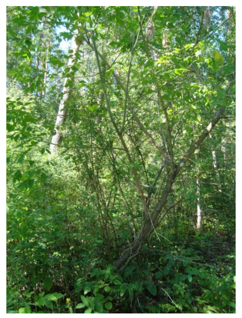
Figure 4. Ulmus laevis-Pinus sylvestris community.